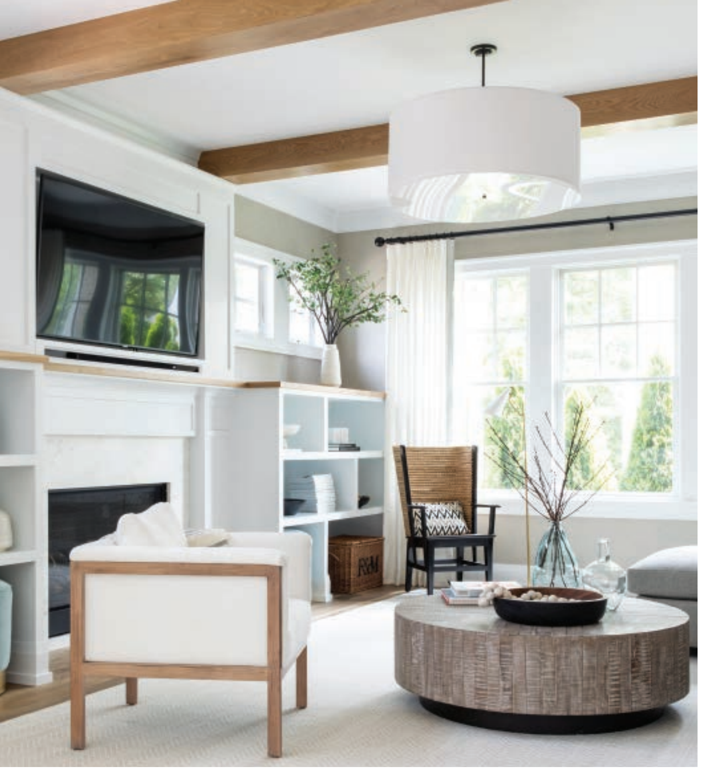
The family room — located off of the kitchen — layers pretty whites and taupes, warm woods and textured surfaces to create a soft, airy space in a laid-back but stylish setting.

"We kept the vibe subtly coastal, casual but polished," Kim says. In the family room, for example, layers of pretty whites and chalky taupes create a soft, airy, relaxed space with soft blue velvet accents. A family-friendly vinyl tweed wallpaper covers the walls, and performance fabrics on the clean-lined sectional (not visible in the photos) and side chair are "lovely, nubby and sophisticated," she says.